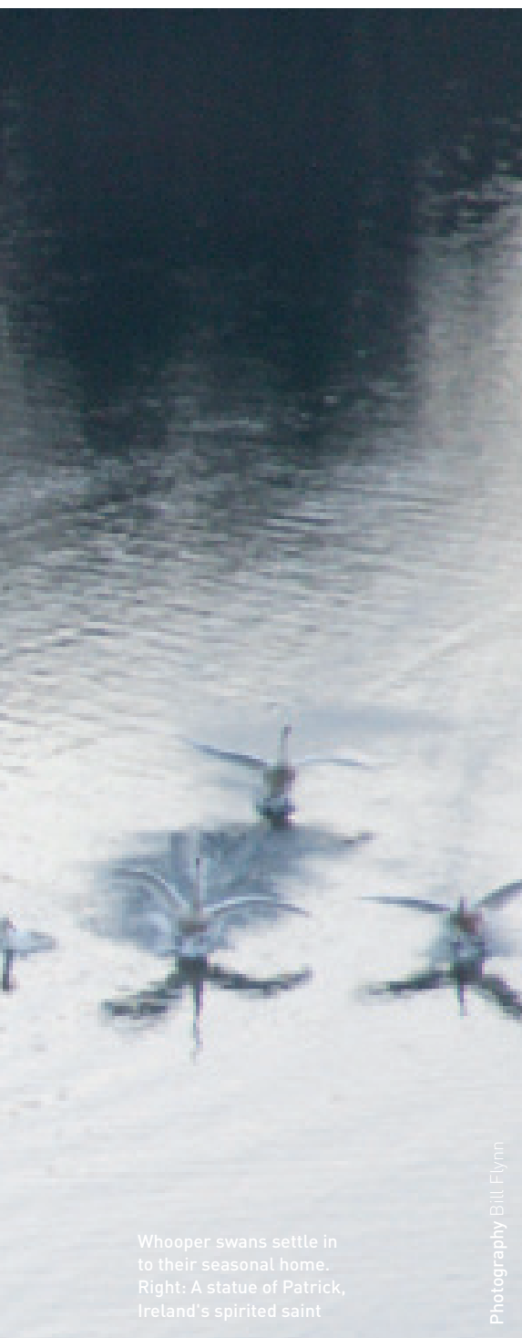
Whooper swans settle in to their seasonal home. Right: A statue of Patrick, Ireland's spirited saint

One of Ireland's best-loved legends is the Children of Lir. Lir was the god of the sea when the Tuatha Dé Danann , the gods, ruled Ireland. He and his wife Eve had two children, Finola and Aed, before she died giving birth to twin boys, Fiacra and Conn. Then Lir married Eva, Eve's sister. Eva soon became jealous of Lir's love for his children, so she took them to a lake and turned them into swans for 900 years. As swans, the children had to spend 300 years on Lough Derravaragh, 300 in the Sea of Moyle and 300 on the west coast of Ireland