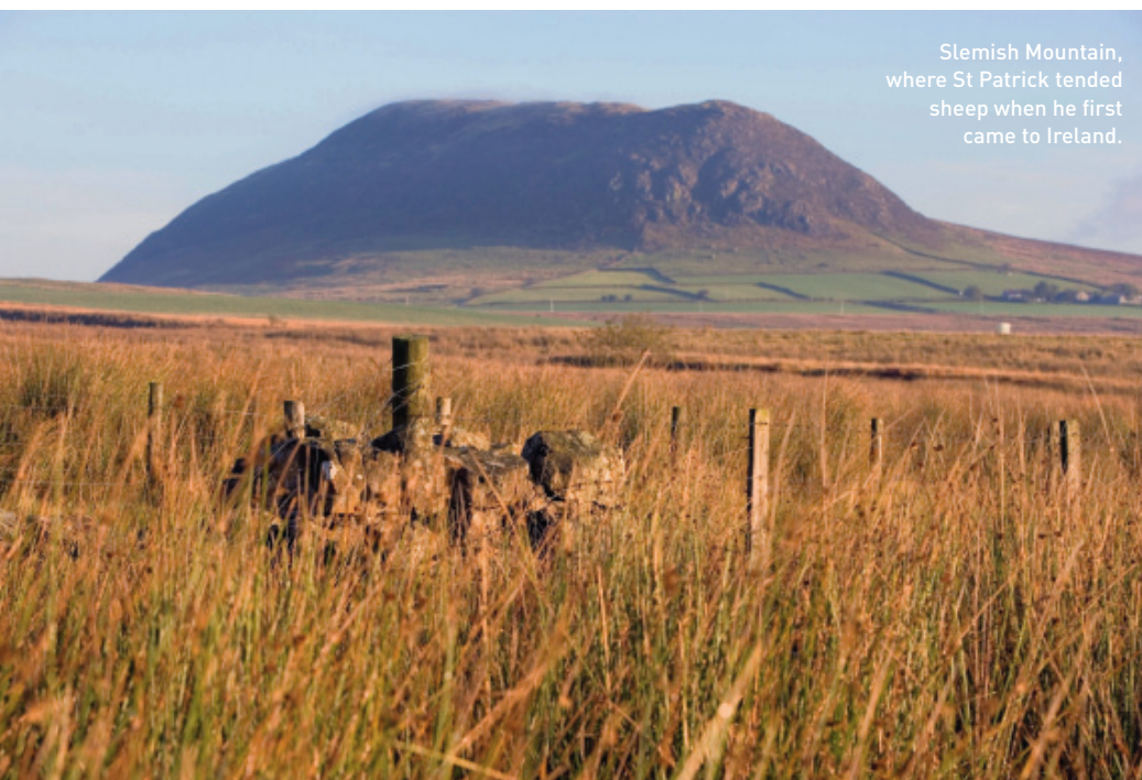
Slemish Mountain, where St Patrick tended sheep when he first came to Ireland.

near Inishglora. The spell would not be broken until they heard the sound of the Christian bell.