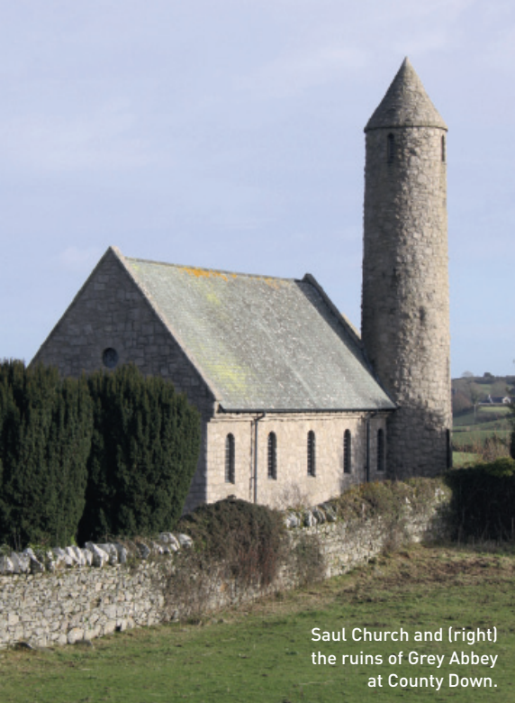
Saul Church and (right) the ruins of Grey Abbey at County Down.