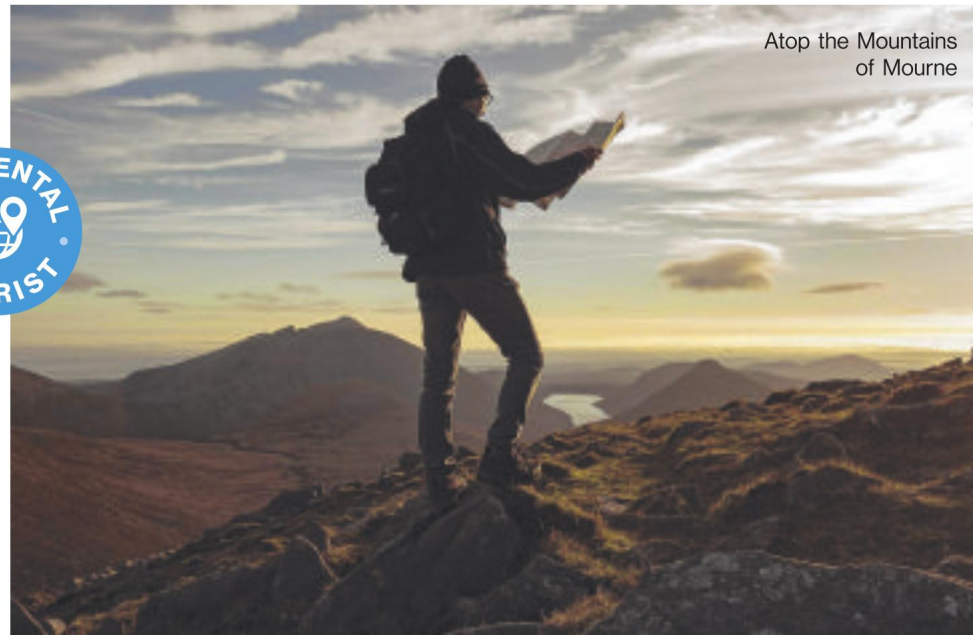
Atop the Mountains of Mourne

St Patrick's Way takes us along quiet country roads past hawthorn hedgerows topped with honeysuckle, before we follow the towpath of the Newry Canal, the oldest summit level canal in Britain and Ireland, and now home to pairs of swans rearing their grey-feathered young. We overnight in