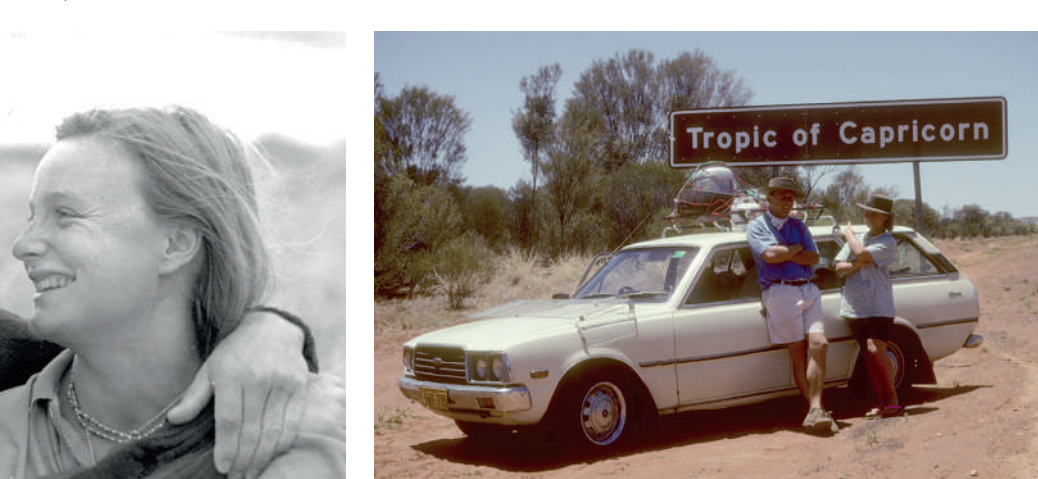
pittwater life The Local Voice Since 1991